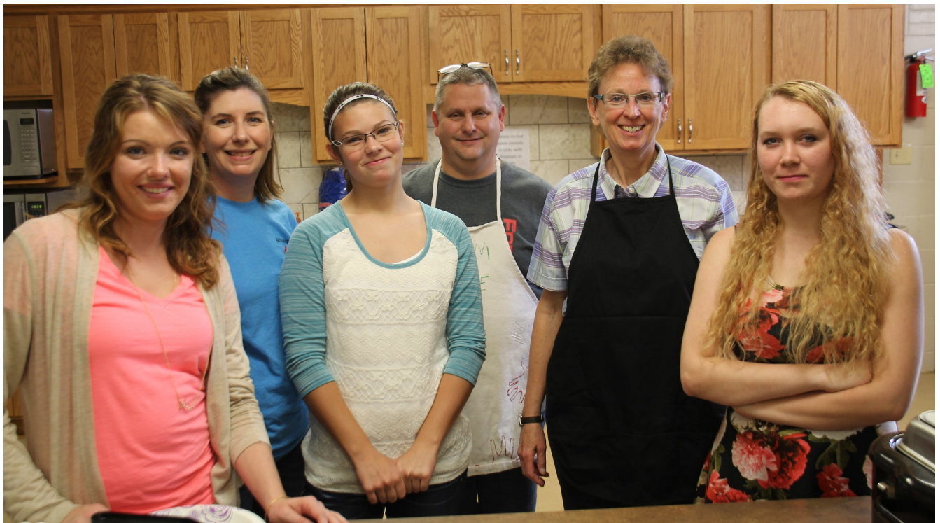
Blessings to the kitchen crew (most of whom posed for the photo) who prepared pancakes and sausage on Sunday, October 11. The freewill offering helped raise funds for children's and youth programming.