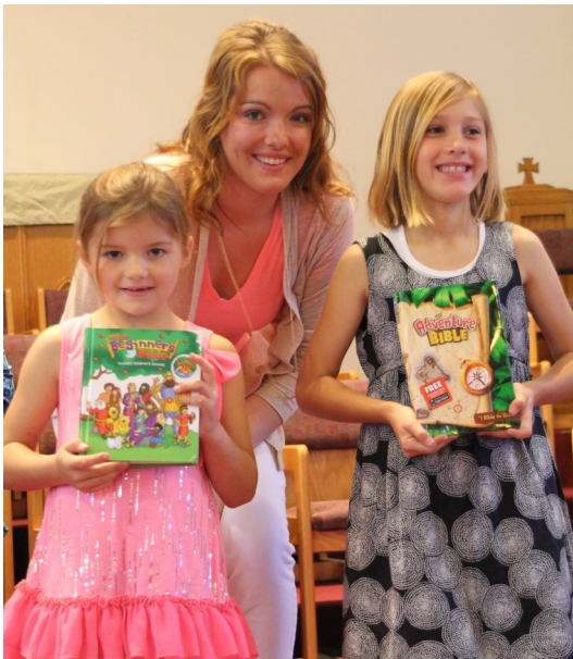
Blessings for children. Bibles were presented to those in kindergarten or fourth grade on Sunday, October 11.